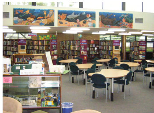
Our library, Carine Senior High School, Western Australia