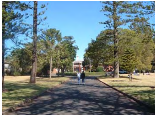
Concordia Lutheran College, Queensland Australia